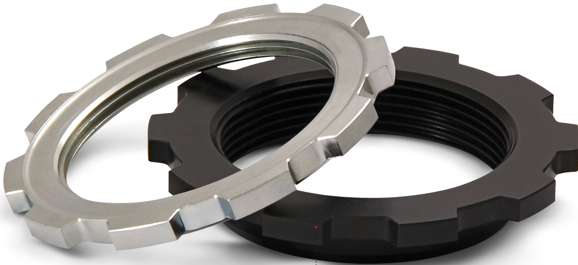
NEW SHOCK PRELOAD COLLARS